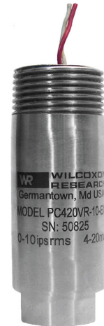
Table 1: PC420Vx-yy-EX model selection guide